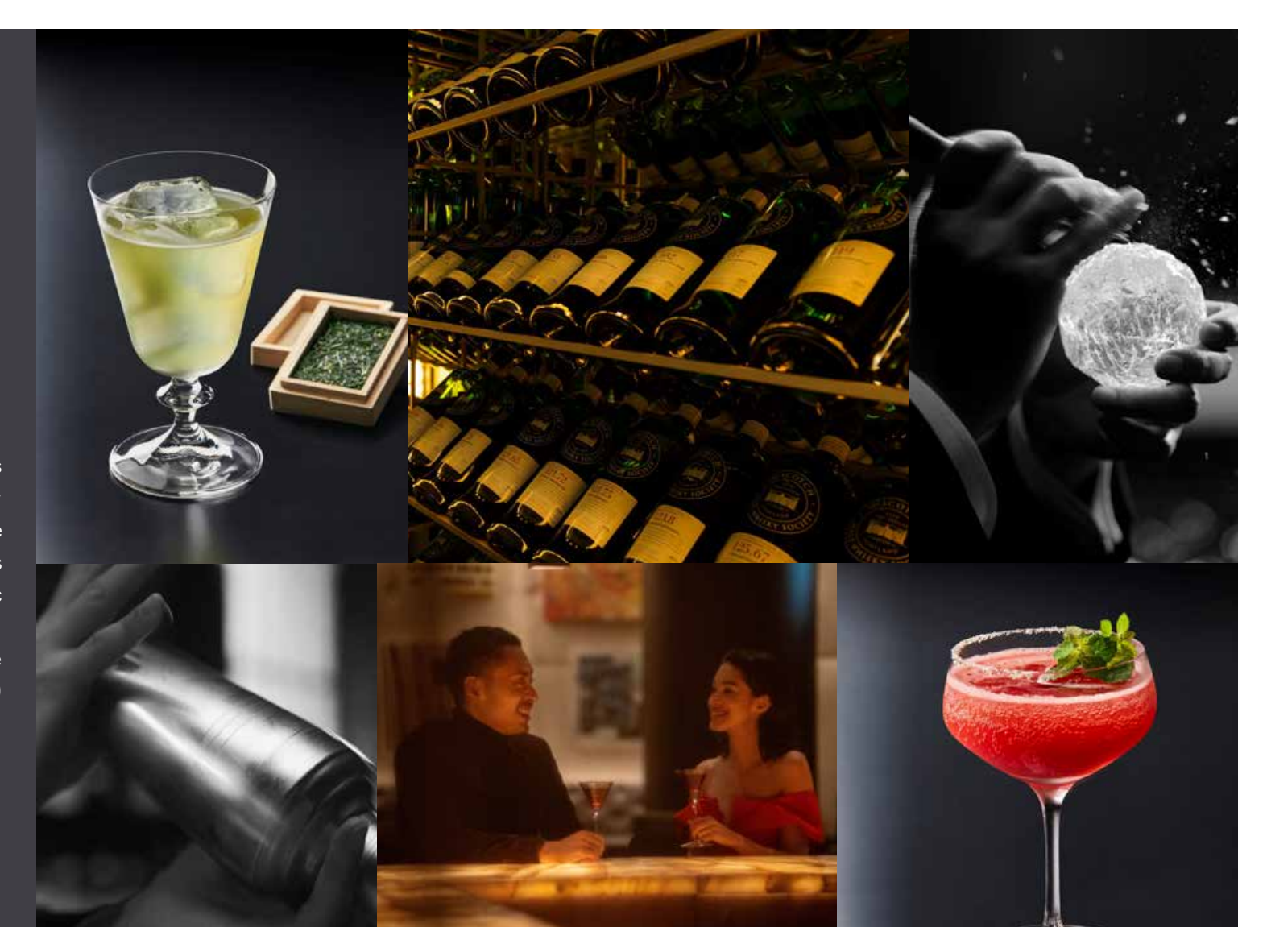
An Art Museum Where You Can Stay In Art Hotel in the Sky Where an Extraordinary Time Awaits まるで泊まれる美術館 ここは非日常を楽しむ天空のアートホテル

Cocktails crafted by our skilled bartenders emphasize the unique bar skills and subtlety of Japan. At The Society, you can experience cocktails that express Japanese aesthetics and are made with an abundance of domestic and international herbs and seasonal fruits. In addition, we offer a selection of local sake from around Japan and apprximately 100 single malt whiskies imported from Scotland. Please enjoy the beautiful night view from the large windows and the soothing music.