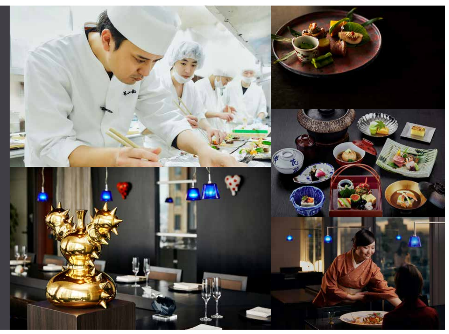
An Art Museum Where You Can Stay In Art Hotel in the Sky Where an Extraordinary Time Awaits まるで泊まれる美術館 ここは非日常を楽しむ天空のアートホテル

Hanasanshou offers a hearty selection of Japanese gastronomy, a fusion of tradition and innovation. From authentic sushi to wagyu beef steak and sashimi, you can enjoy the best of Japanese culinary culture. Traditional Japanese sake, shochu, and Japanese wines are also available, allowing you to enjoy Japanese food culture to your heart's content along with fine.