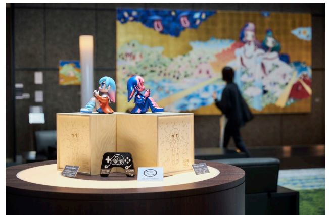
Art exhibit in the lobby