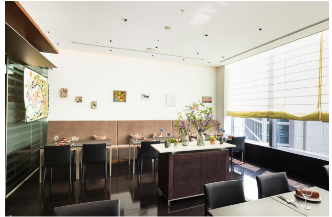
ART Colours Dining