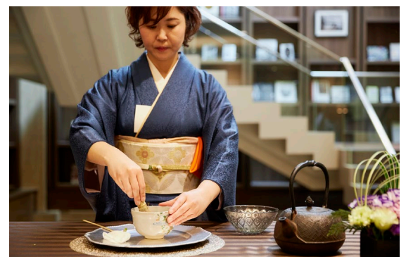
Table-Style Tea Ceremony - Experience Modern Culture In our lobby, surrounded by approximately 1,500 books and traditional crafts, you can enjoy a modern table-style tea ceremony performed by the Tsubaki-no-Kai. This special experience allows you to savor the elegance of the tea ceremony in a serene atmosphere.

Date: Every Thursdays at 10:00 a.m. – 10:45 a.m.