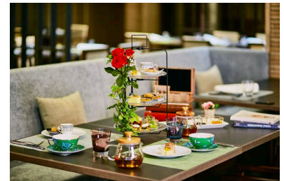
Blissful afternoon tea

At The Dining, we have offer “Blissful afternoon tea.” You are always welcome to enjoy our 1,500 books. Please enjoy a blissful time with your favorite black tea flavor, along with a book you like in hand, and sweets delivered from three types of restaurants that includes Japanese, Chinese, and Western cuisine. We are happy to accept reservations from one person.