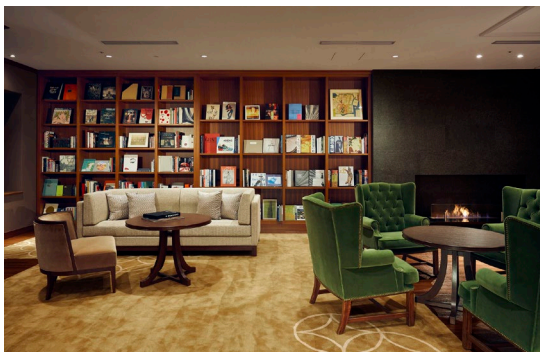
1F Library Lounge

We offer library corners throughout the hotel, curated by Ginza Tsutaya Bookstore, featuring a wide range of 1,500 books from Japanese culture to architecture, photography, and art. Enjoy serendipitous encounters and your time spent with us.