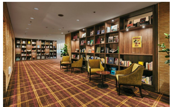
2F Foyer -Book & Culture